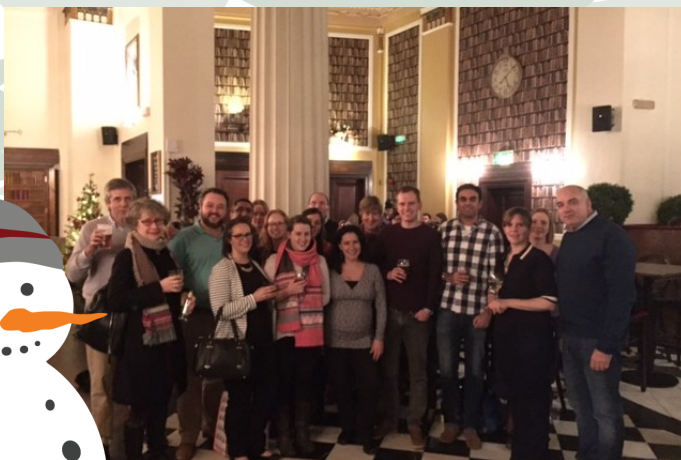
CAP-IT Investigator's Meeting Nov 2016

All that's left to say now is Merry Christmas and Happy New Year!